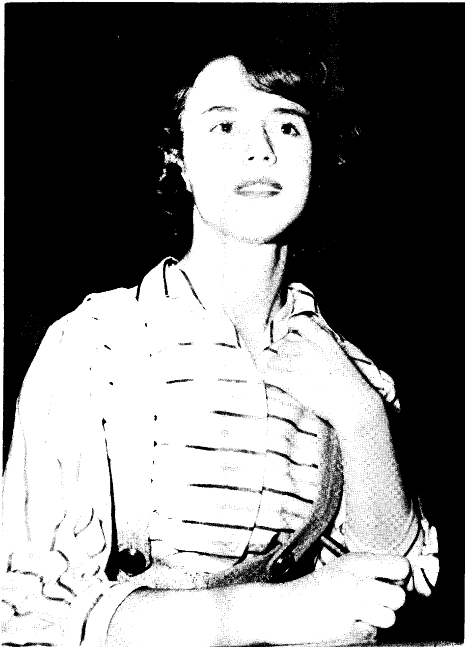
The bright look of the "future" is reflected in the face of one of the gifted students participating in a Seminar sponsored by The Joe Berg Foundation.

Certain facts are evident. Most of our leaders today have come from the gifted children of yesterday. In order that we develop the gifted child's talents and stimulate his interests we must provide him with necessary opportunities to utilize his full capabilities. The problem of providing the proper motivation to encourage our youth to embark upon careers in science and mathematics is of the greatest importance.