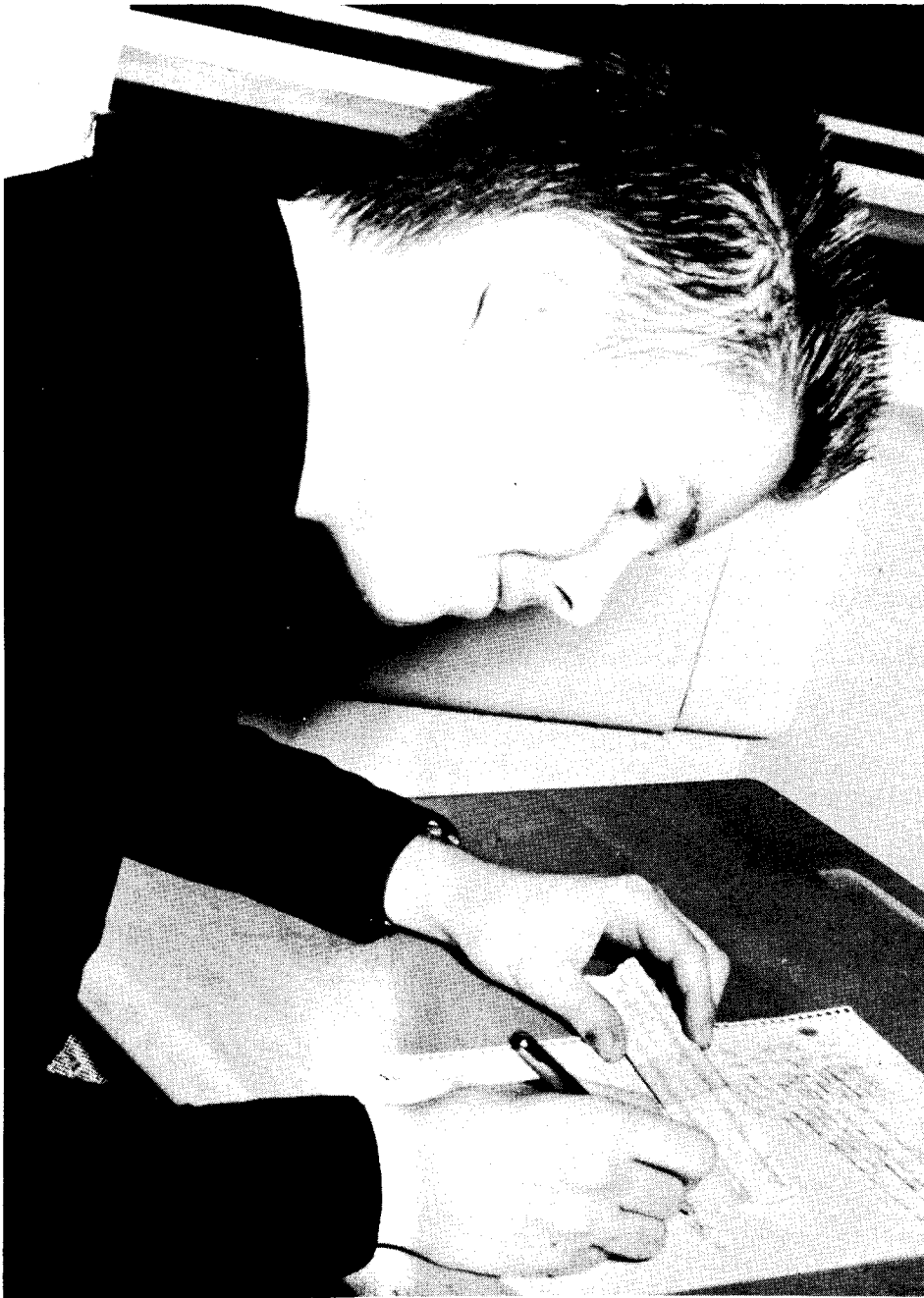
A budding scientist puts his slide rule to work during a Seminar session.