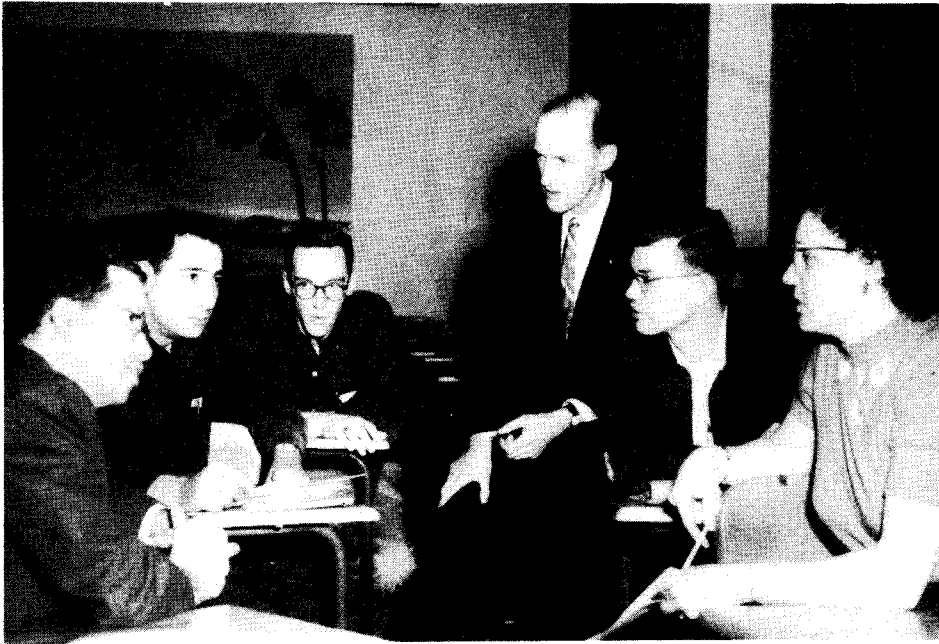
Lesson plans for the evening Seminar meeting are discussed by a group of volunteer Seminar instructors.